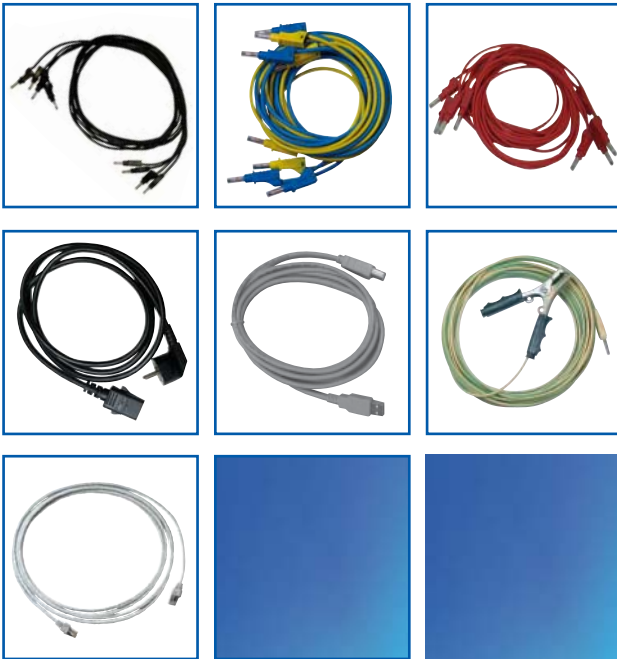
Standard set of testing cables