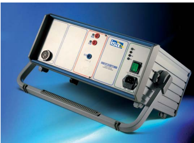
AMV 66 - External amplifier