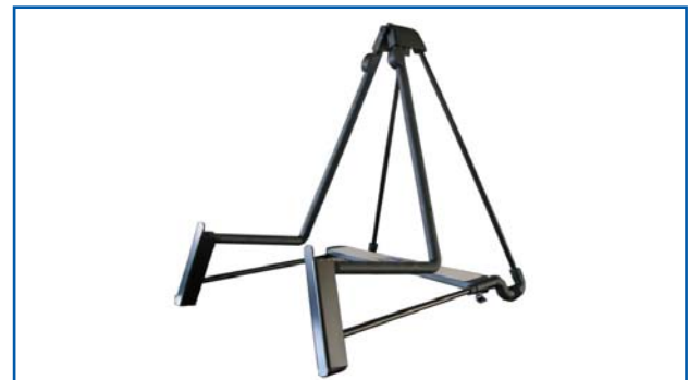
Stand up support