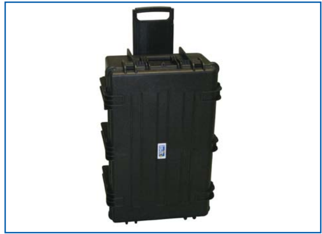
Heavy duty transport case