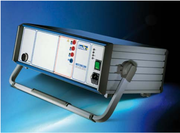
AMI 99 - External amplifier