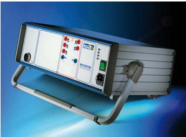
AMIV 66 - External amplifier