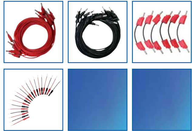
Optional set of testing cables