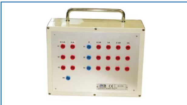
IN 2 CDG - Option for High Burden Relays