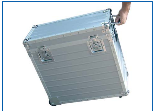
Heavy duty transport case in aluminium